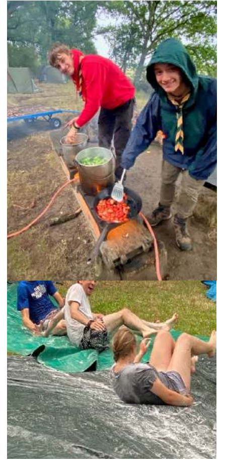
21 Explorers were alert enough to beat the rush and get themselves a coveted